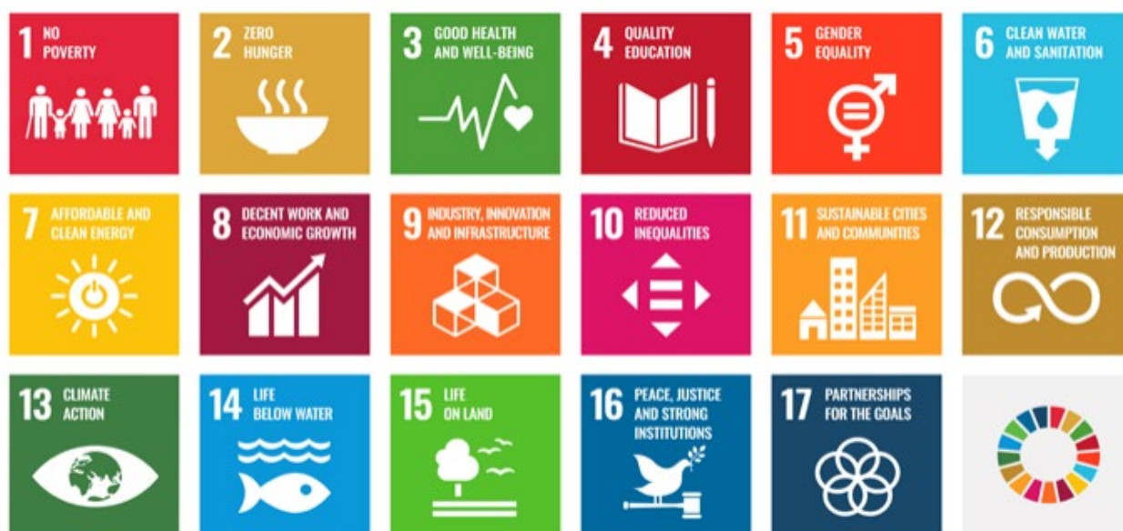
Figure 1: un.org

To promote sustainability work, universities of applied sciences have worked together to prepare joint sustainability commitments and related measures. The Sustainability Programme for Universities of Applied Sciences 2026–2030 provides a common framework and supports the work of all 24 universities of applied sciences in Finland in their efforts towards a more sustainable and responsible future.